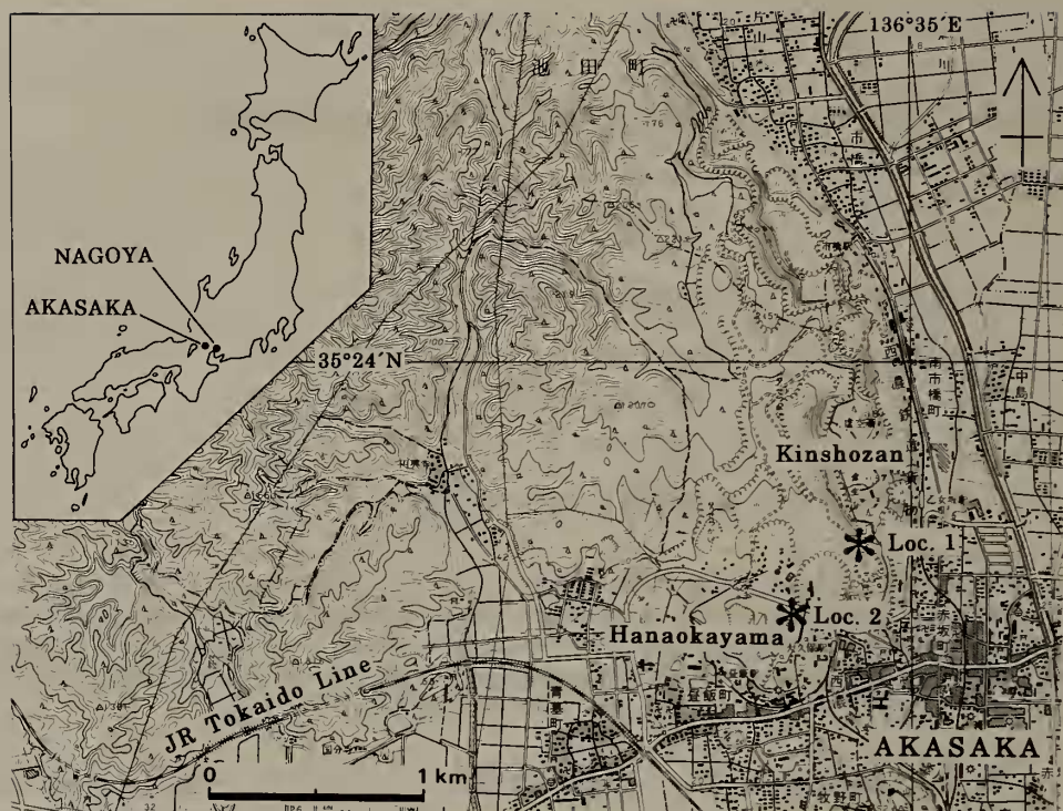
Figure 1. Map showing the fossil localities (using the topographical map of "Ogaki" scale 1 : 25,000 published by Geographical Survey of Japan).

Wu, 1982), Yunnan (Fang and Fan, 1994), Sichuan (Hayasaka, 1917, 1922b; Huang, 1932), Guizhou (Hayasaka, 1917, 1922b; Huang, 1932; Feng and Jiang, 1978), Guangxi (Huang, 1936; Yang et al. , 1977), Guangdong (Yang et al. , 1977; Zhan, 1979), Hunan (Yang et al. , 1977; Liao and Meng, 1986) and Hubei (Yang et al. , 1977; Yang, 1984) in South China, Jiangxi (Hayasaka, 1922b), Fujian (Wang et al. , 1982; Zhu, 1990) and Zhejiang (Liang, 1990) in East China, Gansu (Zhang et al. , 1983) and Qinghai (Jin et al. , 1979) in Northwest China, Inner Mongolia (Grabau, 1931; Lee and Gu, 1976; Lee et al. , 1980; Duan and Li, 1985; Gu and Zhu, 1985), Heilongjiang (Lee et al. , 1980) and Jilin (Lee et al. , 1980) in Northeast China, South Primorye in eastern Russia (Licharew and Kotljar, 1978), South Kitakami Belt (Yabe, 1900; Hayasaka, 1917, 1922a; Tazawa, 1976, 1987; Minato et al. , 1979), Hida Gaien Belt (Tazawa, 1987; Tazawa and Matsumoto, 1998), Maizuru Belt (Mashiko, 1934; Shimizu, 1961) and Mino Belt (this paper) in Japan.